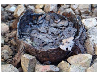
Hidden corrosion damage of the baseplate