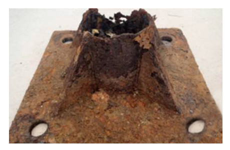
Corrosion damage of the baseplate

Intertek's analyses were taken into account by RAIB and contributed to the conclusions made by the body as to the cause of the corrosion and the evaluation of the circumstances that occurred in the run-up to the incident.