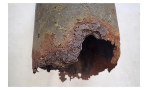
Corrosion damage at the base of the signal post

in its report to prevent a similar incident happening again in the future.